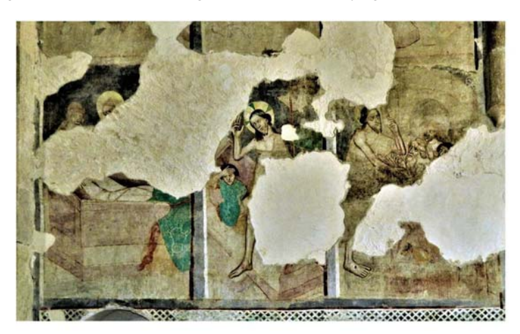
Fig. 16 – Curciu, The Entombment, the Resurrection, Descent of Christ into Hell.