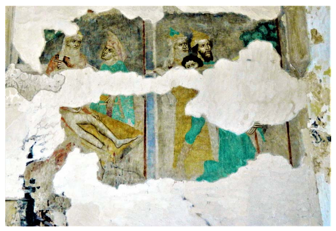
Fig. 25 – Curciu, scenes from the lives of Sts. Cosmas and Damian.