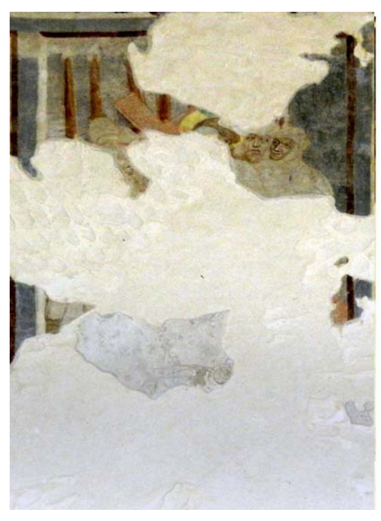
Fig. 18 – Curciu, The Carrying of the Cross.