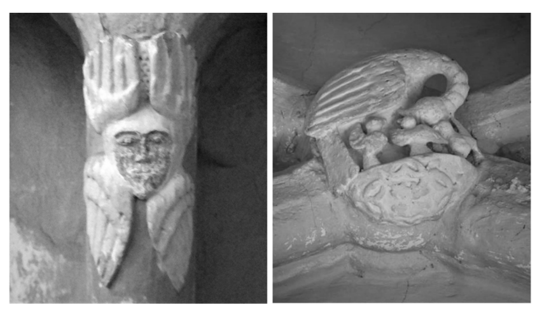
Fig. 6-7 – Curciu, sculptures inside the choir of the church, detail of the sedilia decoration and roof boss.