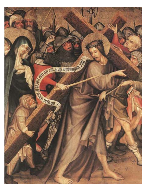
Fig. 19 – Thomas of Cluj, The Carrying of the Cross (1427), Esztergom, Keresteny Muzeum.