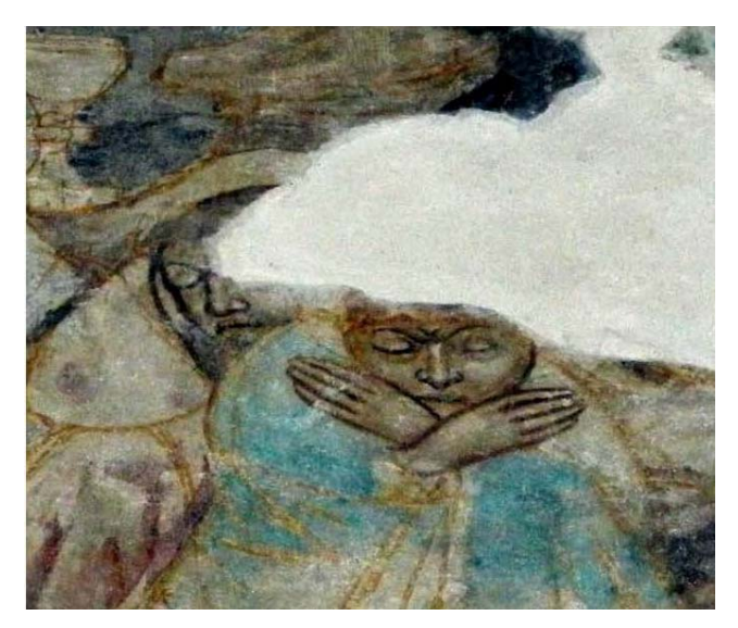
Fig. 21 – Curciu, The Prayer on the Mount of Olives, detail.