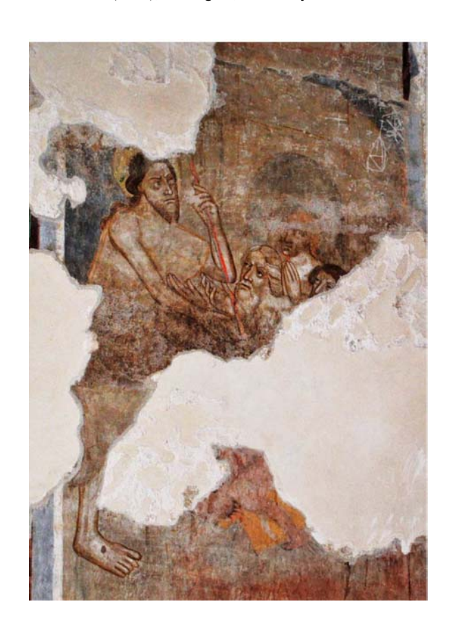
Fig. 20 – Curciu, Descent of Christ into Hell.