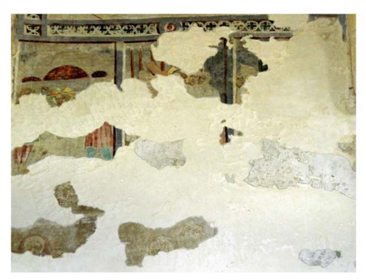
Fig.\ 15-Curciu,\ The\ Crowning\ with\ Thorns,\ the\ Carrying\ of\ the\ Cross,\ lacunas.