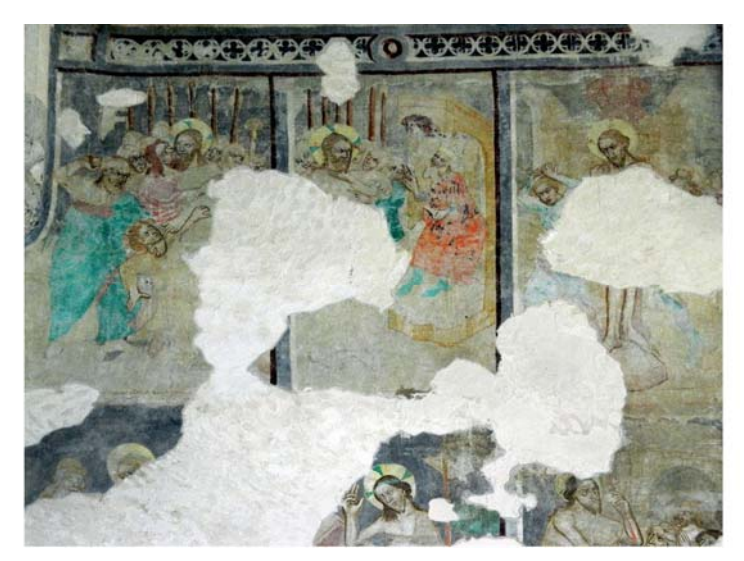
Fig. 14 – Curciu, The Capture, Jesus presented at Herod, The Scourging.