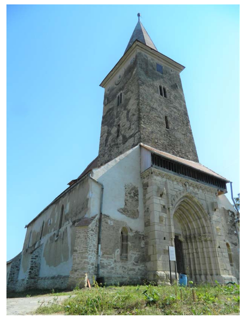
Fig. 1 – Curciu, the evangelical church seen from north-west.