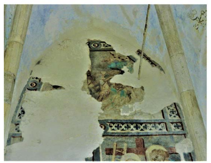
Fig. 11-13 – Curciu, The Triumphant Entry into Jerusalem, The Last Supper, The Prayer on the Mount of Olives.