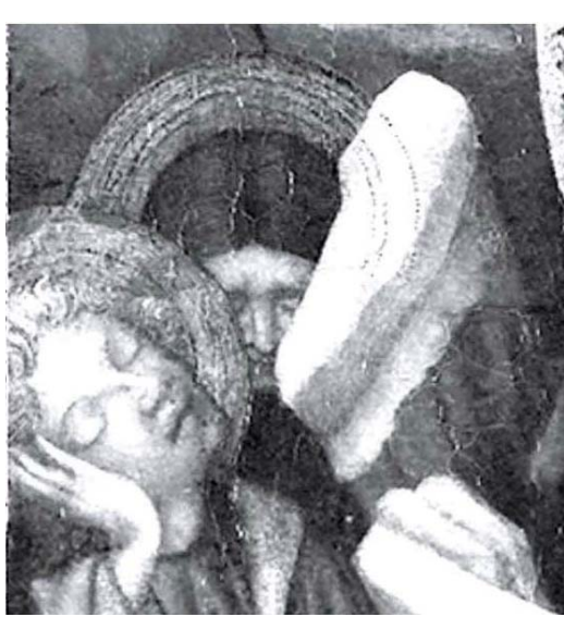
Fig. 24 – Thomas of Cluj, The Prayer on the Mount of Olives (1427), detail, Esztergom, Keresteny Muzeum.