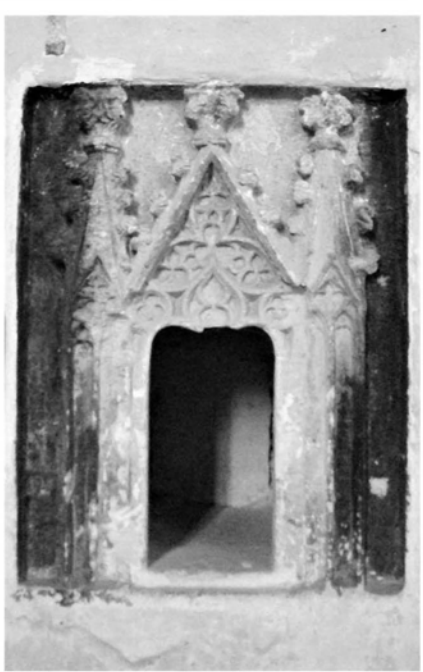
Fig. 4.5 – Curciu, sedilia and sacramentary nische.