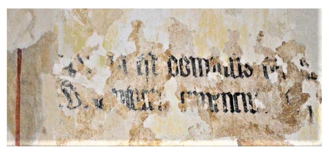
Fig. 26 – Curciu, inscription on the northern wall of the apse.

This posthumous miracle recounted by Jacobus de Voragine in his Legenda aurea (c. 1275) refers to the healing of the verger of the church of Sts. Cosmas and Damian in Rome. The two saints appeared in his dream "carrying with them iron instruments and ointments", amputated the leg consumed by cancer, and substituted it with