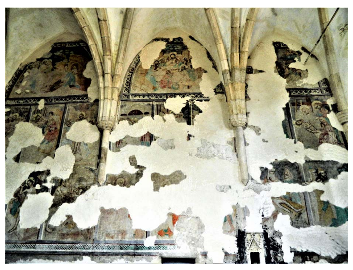
Fig.\ 10-Curciu,\ general\ view\ of\ the\ ensemble\ of\ the\ northern\ wall\ of\ the\ choir.