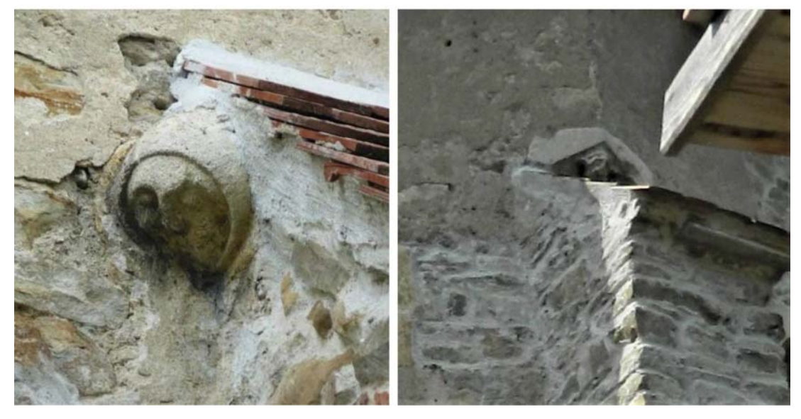
Fig. 8-9 – Curciu, sculptures outside the choir of the church.