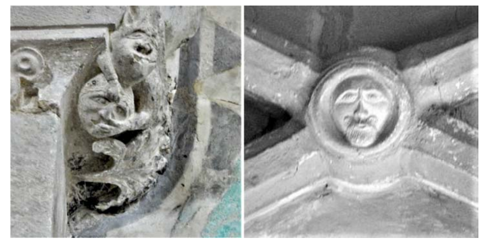
Fig. 2-3 – Curciu, sculptures inside the choir of the church, capitel and roof boss.