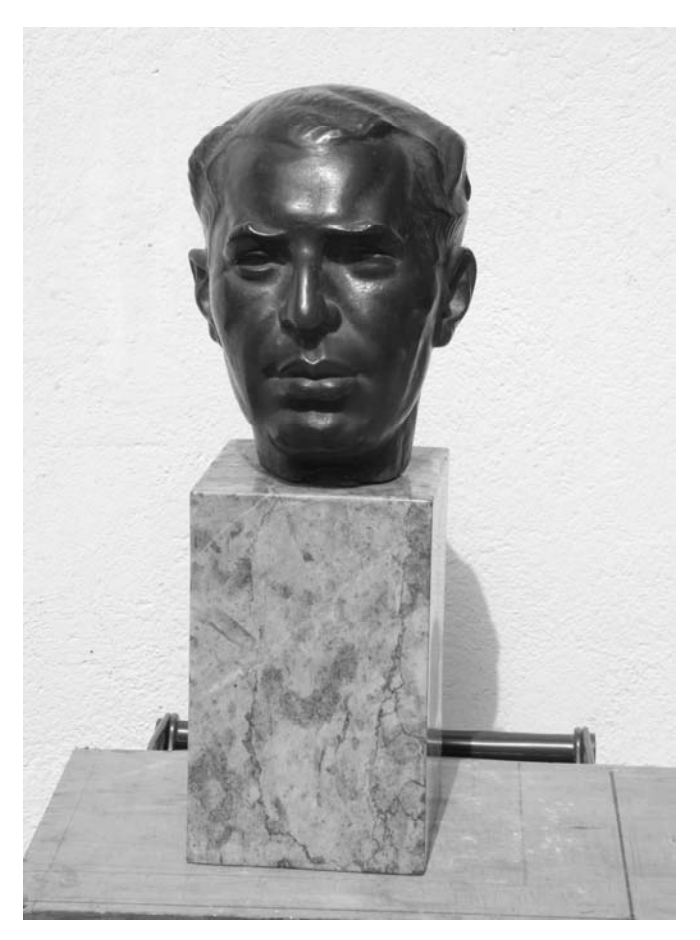
Fig. 3 – Ferdinand Gallas (1893 – 1949), Bust of the Physician Moritz Schönberger, bronze, 520 x 240 x 200 mm, The Art Museum of Timişoara, inv. no. 4174.