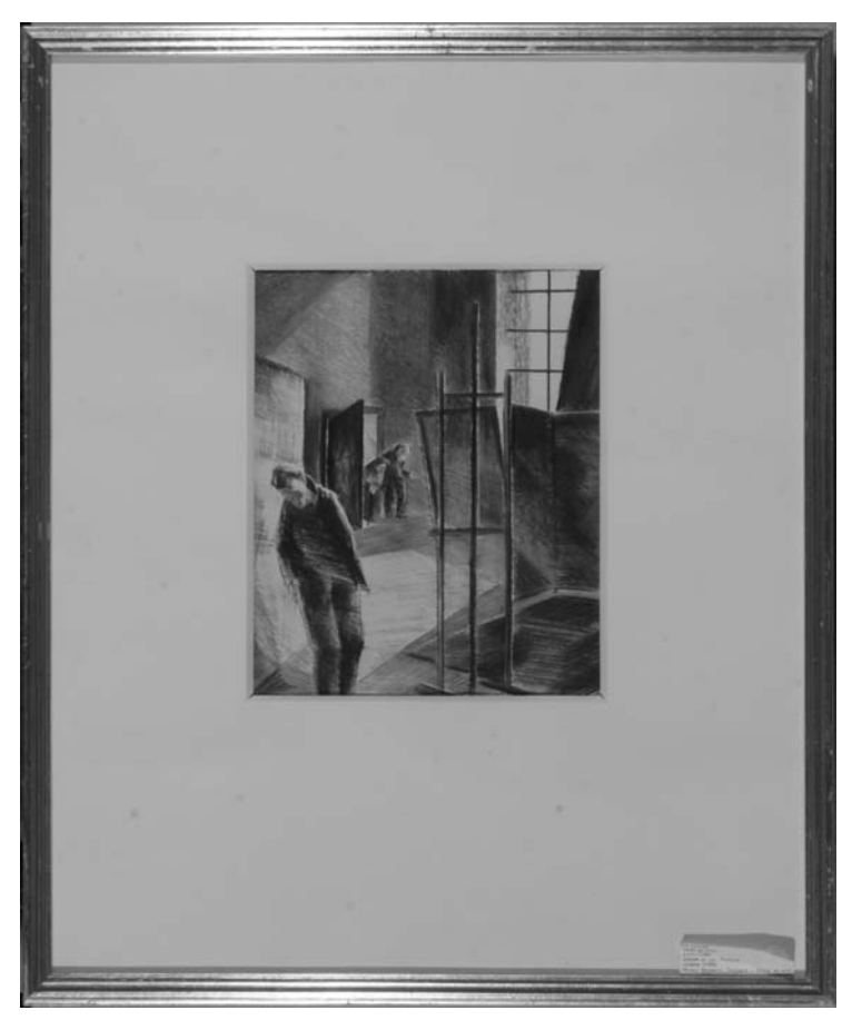
Fig. 1 – Julius Podlipny (1898 – 1991), The Artist within the studio (1929), charcoal, 310 x 260 mm, The Art Museum of Timişoara, inv. no. 1671.