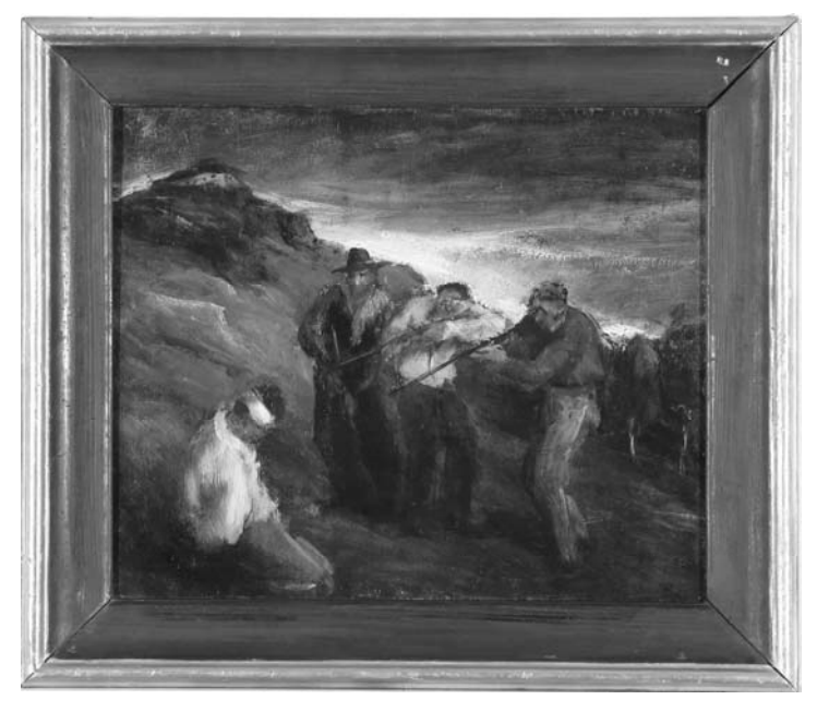
Fig. 2 – Albert Varga (1900 – 1940), Partisan (1927), oil on canvas, 46.5 \times 57 cm, The Art Museum of Timişoara, inv. no. 1680.