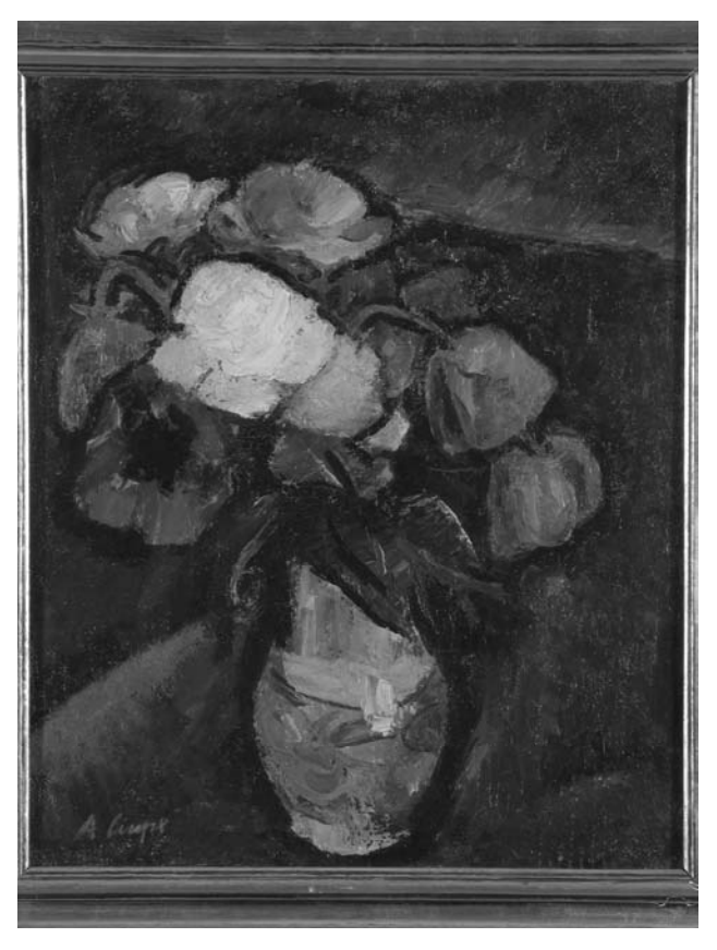
Fig. 8 – Aurel Ciupe (1900 – 1988), Flowers, oil on canvas, 64 x 54 cm, The Art Museum of Timişoara, inv. no. 292.